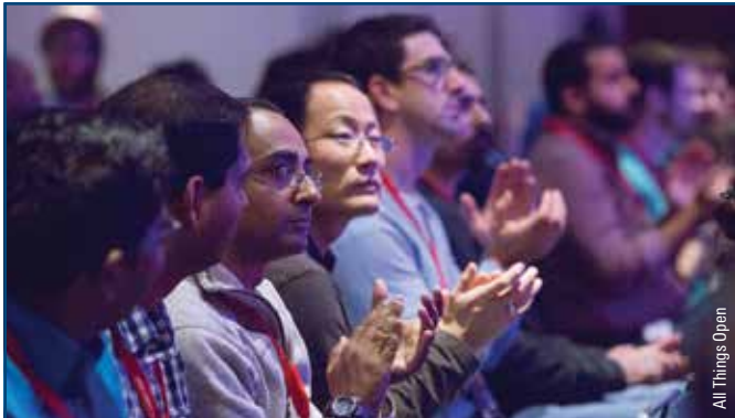
All Things Open